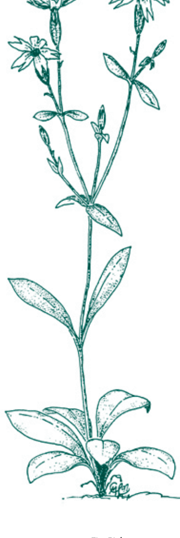
Fire Pink Silene virginica